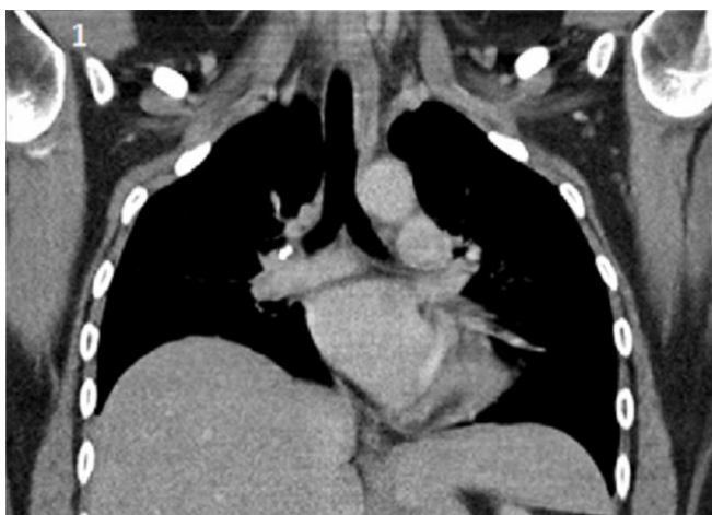
Figure 1 Transverse section of CT scan. There is reduced lung volumes bilaterally

During a routine clinic for international normalised ratio (INR) review six months later, she was noted to be dyspnoeic and was readmitted to rheumatology ward for investigation. On examination, she was tachycardic with pulse rate of 118 beats per minute and tachypnoeic with respiratory rate of 28 breaths per minute. The oxygen saturation was 98% in room air. Her body mass index (BMI) was 37 kg/m 2 and she admitted to significant weight gain since a year ago. Lung examination revealed reduced breath sounds at the bases but no stony dullness to percussion. A repeat chest radiograph revealed reduced lung volumes bilaterally with elevated hemidiaphragms.